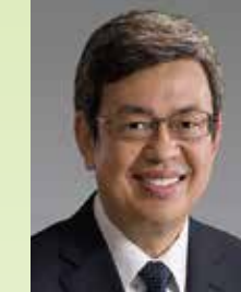
Dr. Chien-Jen Chen Genomics Research Center, Taiwan